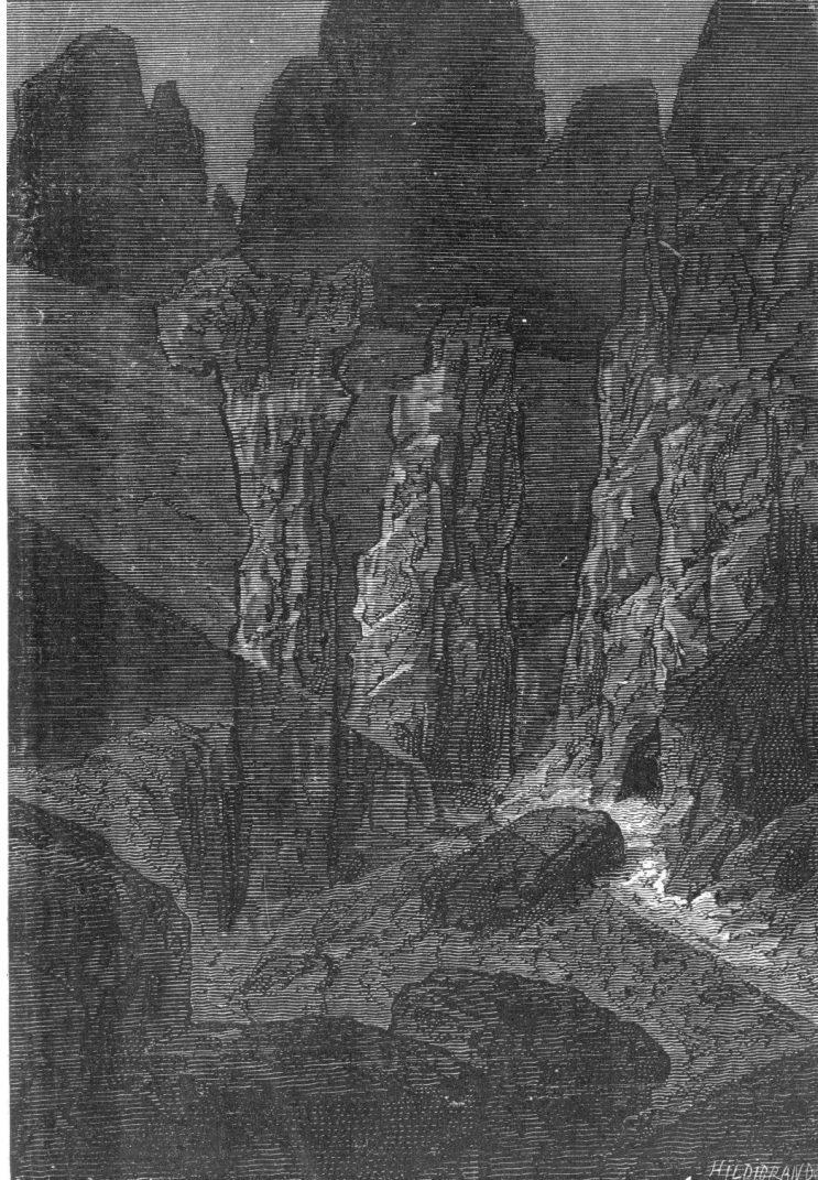
Vingt mille lieues sous les mers (Twenty Thousand Leagues Under the Seas) , second part, chapter 11 : «C'est l'épreuve positive que j'en donne ici. (Page 319.)» (“A deep-sea photograph”)

Between the first introductory pages and the conclusion already mentioned above, their analysis is divided into three parts, each with a significant title: “Verne's Detective and Poe” (p. 9-31), “Verne and the Gothic” (p. 31-45) and “Verne's method” (p. 45-53).