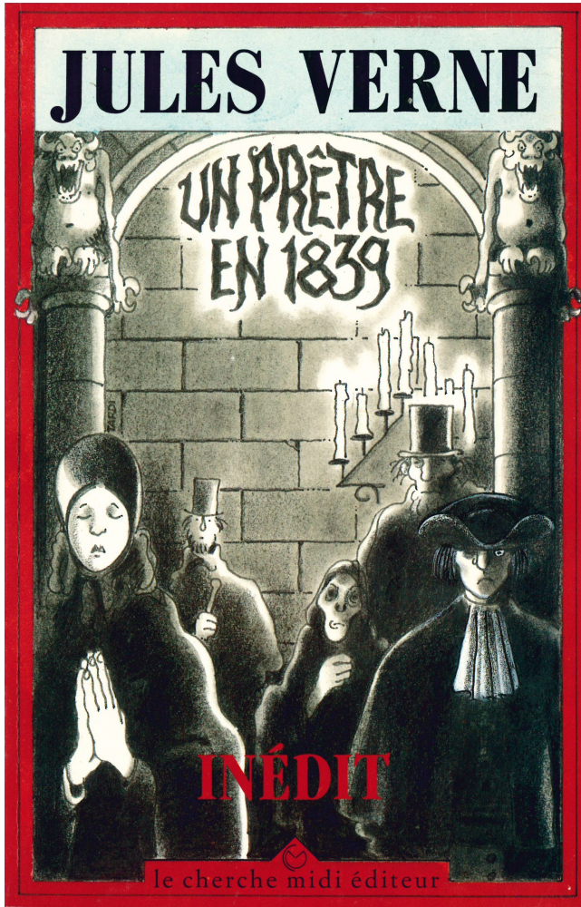
Cover of the French edition in 1992 (Paris, le cherche-midi)