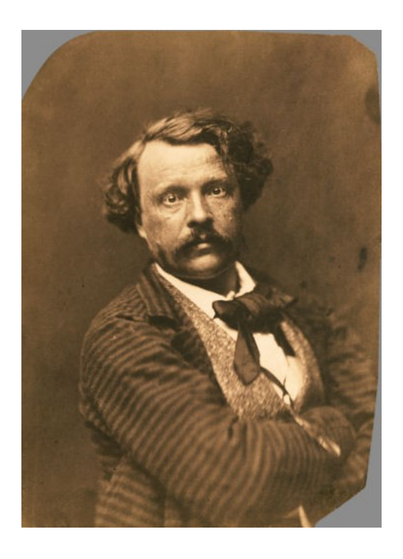
Nadar, self portrait in striped coat, circa 1856–1858

I'm having Hetzel send you a copy of Robur the Conqueror . In it you'll find all your ideas about the Heavier-Than-Air ! In a guise of pure fantaisie [i.e. caprice, whimsy, imagination], I've tried to raise the question once more. Tell me if it suits you, and if it pleases you. (L1886) [5]