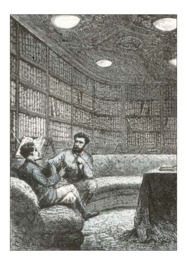
Figure 1. Captain Nemo's library. Vingt mille lieues sous les mers I, xi. Illustration by Alphonse de Neuville (1869–70).

general, the procedural double of his methods of literary composition, in the decade between his creations of Dufrénoy and Nemo; this is more clearly seen if we work backwards, from 1870 to 1863, rather than in the order in which the novels were written. The method of errant reading is equally as significant in later novels of the Voyages extraordinaires – in relation to an expanding Vernian corpus, it may be more significant in those novels – but the evidence for the method is more subtle in those works, since it has become by then a typical trait of Verne's textual operations.